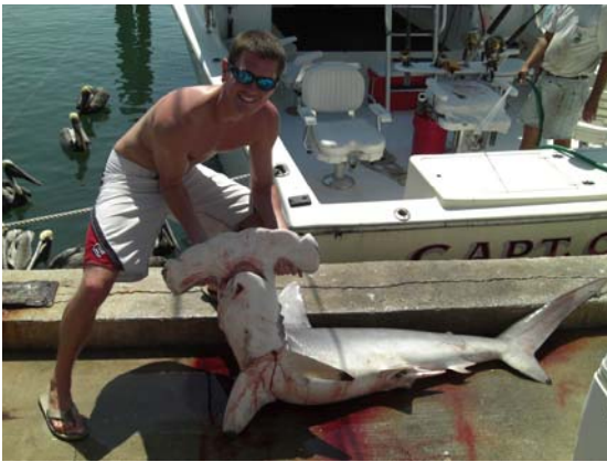
The hammerhead shark I caught in Key West.

I have always worked hard on any project that I have started and always make sure that things are done on time. I'm usually very organized, goal-oriented, and productive.