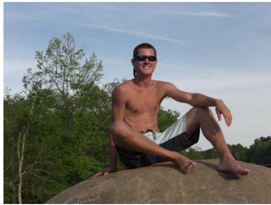
At the river in Columbia, SC.