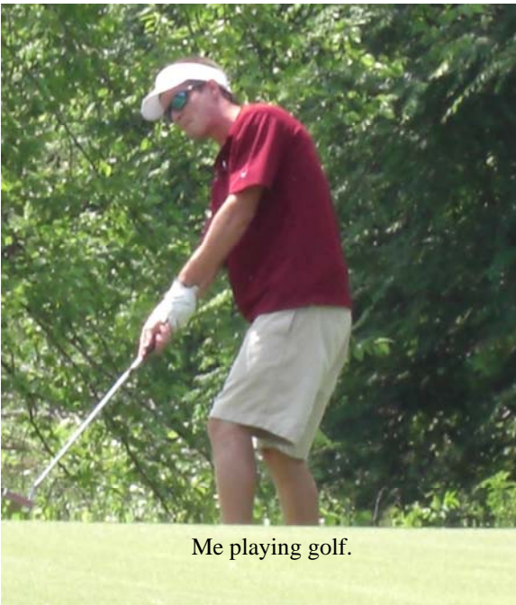
Me playing golf.